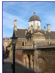
The Gate of Honour